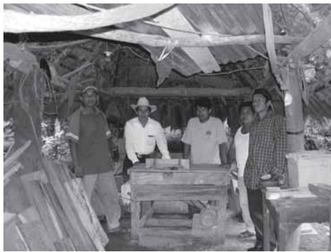
Carpenters' Workshop in Pajapan, Mexico

One explanation is their dependence on the natural environment for survival. Many ethnic groups live in isolated areas where they understand the need to respect their surroundings. In addition, recent outside interest for resources (wood, oil, water, space) has required special attention to protect what is valuable and necessary for their community's survival.