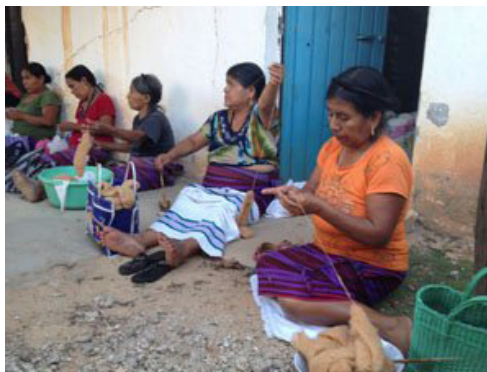
Spinning with drop spindles made from manglar root

The tradition of textile production is centuries old in San Juan Colorado—an