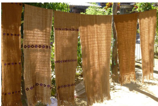
Recently produced textiles being reviewed for size and quality

indigenous Mixteco village on the coast of Oaxaca. This region of Oaxaca and