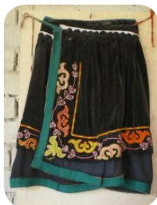
"Beldemshi" the typical Kyrgyz woman's apron, museum display