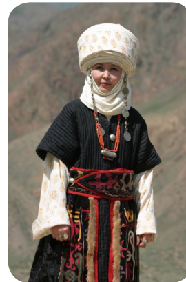
Kyrgyz woman in costume wearing typical headdress "Elechek."

Prior to colonization by Tsarist Russia, the Kyrgyz had lived as transhumant pastoral nomads (people who move seasonally with their livestock between fixed summer and winter pastures), and their decorative arts were tied to the processing of animal husbandry products (sheep, goats, camels, yaks). During Soviet rule, the previously self-sufficient