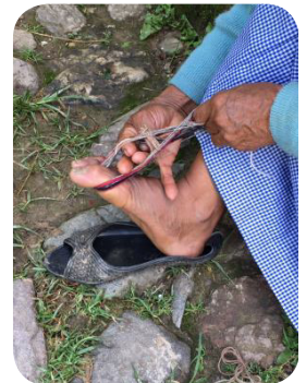
The strap was woven on a loom but needed a few more centimeters to meet the specs.