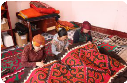
Textile Workshop 2012, three young women in varying types of attire making a Kyrgyz "Shyrdak" rug

At recent trade fairs, I had often admired the assorted stitched and felted products – slippers, sturdy hats, striking shyrdak rugs – presented by artisans from Kyrgyzstan, and wished to know more