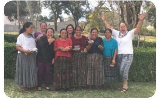
The women of Polochic

The women expect to be able to sell their work in their local markets. One benefit of this work is that the cost of their materials will be low. The UN Women will be working with them to help develop outside markets.