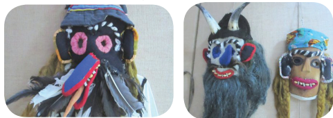
Handmade masks worn at New Year's and on Carnival to "drive out winter demons and herald the return of light"

As a child growing up in Germany, Easter was a school and family highlight that I, along with my classmates, looked forward to after the sometimes dreary months following New Year's. Almost everyone we knew seemed to be in a good mood during the weeks preceding Easter, busily decorating Easter eggs,