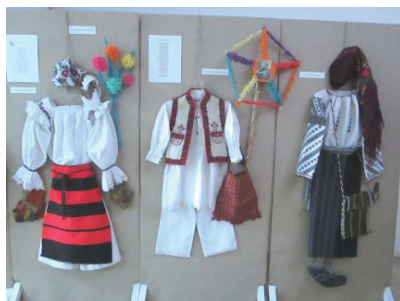
June solstice festival costumes heralding a good farming season

What has charmed me is how the colorful and imaginative folk costumes worn to celebrate the return of Spring throughout