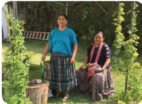
Two workshop participants

During my first week, I worked with the UN Women/ONU Mujeres, whose mission is to empower rural women. They selected