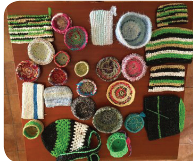
Baskets and bags from the workshop

They learned coiling, crocheting, and cordage-making, using recycled plastic bags and used clothing. They were all skilled and learned quickly. They made lots of bas-