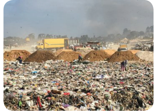
Guatemala City dump

kets/ canastas and bags/ bolsas . They helped and taught each other, and will share their skills in their communities.