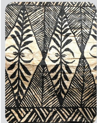
Top: Tapa cloth prior to decorating. Bottom, finished tapa cloth