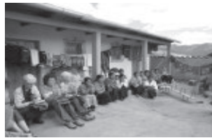
WARP members and local weavers during unforgettable 2007 Annual Meeting in Guatemala

It is no exaggeration to say that the annual meeting is the most important activity sponsored by WARP. As outlined above, it was truly the reason the organization was founded. You can take part in this memorable event by making your reservation now to attend WARP's 2008 Annual Meeting from March 7-9, 2008 at Camp Casey on Whidbey Island in Washington State. A registration form is on page 13.