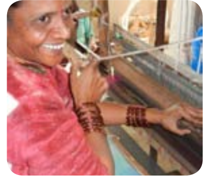
A weaver at work at WomenWeave

to WomenWeave. He explained to me that he wanted to work in the handloom world because of its potential to provide income throughout India. It is estimated