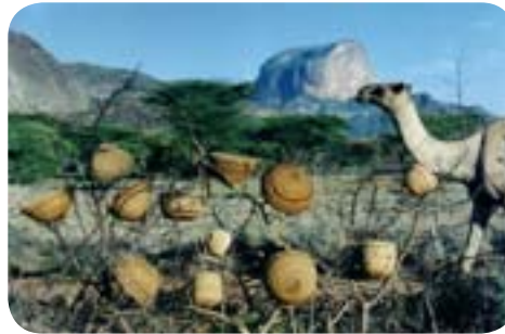
Early marketing

many connections around the world. In 2005 the group was selected as one of