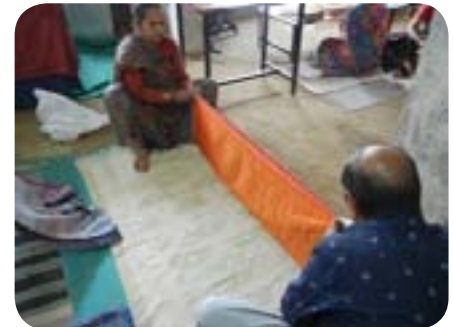
Folding saris at WomenWeave

that there are 4.5 million handweavers throughout India, the second largest form of employment in rural India after agricul-