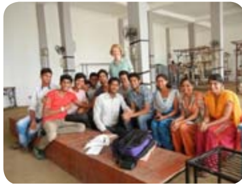
The students at the Handloom School

Recently, I had the opportunity to travel to India. As a handweaver and avid lover of ethnic textiles, I was eager to interact with weavers during my trip. WARP members helped me make the contact that led to a fascinating and deeply rewarding visit to WomenWeave and the Handloom School in Maheshwar, in central India (see page 10 for previous newsletter article about WomenWeave). Maheshwar is a historic, pic-