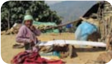
On the trail in Nepal

This was my fifth trip to India (and also to Nepal) and the best - though I always say that! On this trip we visited Kolkata and Delhi and also spent time in less frequently visited states: Assam and Meghalaya are in the northeast of the country bordering Bangladesh. We also visited Odisha (formerly Orissa), south of Kolkata.